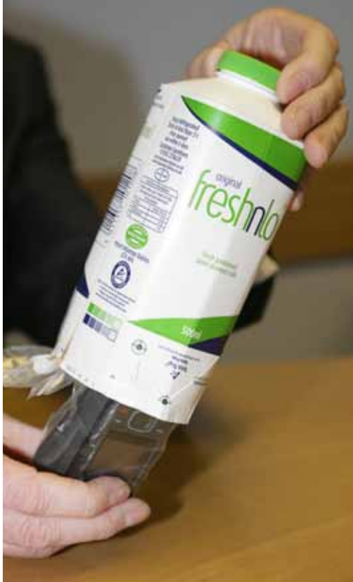
Mobile phones were concealed inside milk cartons.