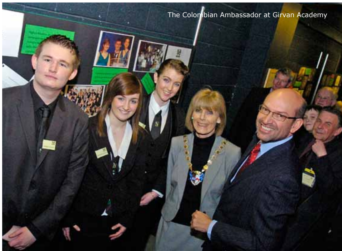
The Colombian Ambassador at Girvan Academy

The work of the schools and the SCDEA in support of Shared Responsibility was highlighted in a BBC Scotland documentary, Avalanche in February 2010. The SCDEA featured prominently in the programme which also included the Scottish Police Service and the work being done to reduce the supply, demand and harm caused by cocaine and other commodities associated with serious organised crime in Scotland.